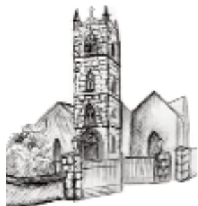
Church of St. John the Baptist, Knock