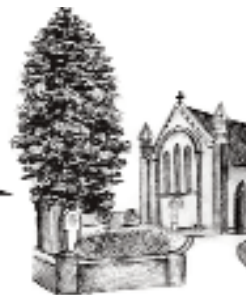
St. Anne's Church, Shanvaghara

NEWSLETTER 12TH APRIL, 2020. Easter Sunday.